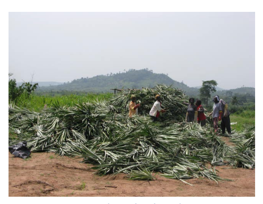
Farmers harvesting pineapples

Conversely, at Torgorme, extensive training programs were conducted, a management structure was put in place, and midsize farmers developed outgrower programs to purchase crops from smallholder farmers. Yet while investments in scheme management were made, the infrastructure was not completed. Consequently, the land was not irrigated and the system was not functional after the compact ended.